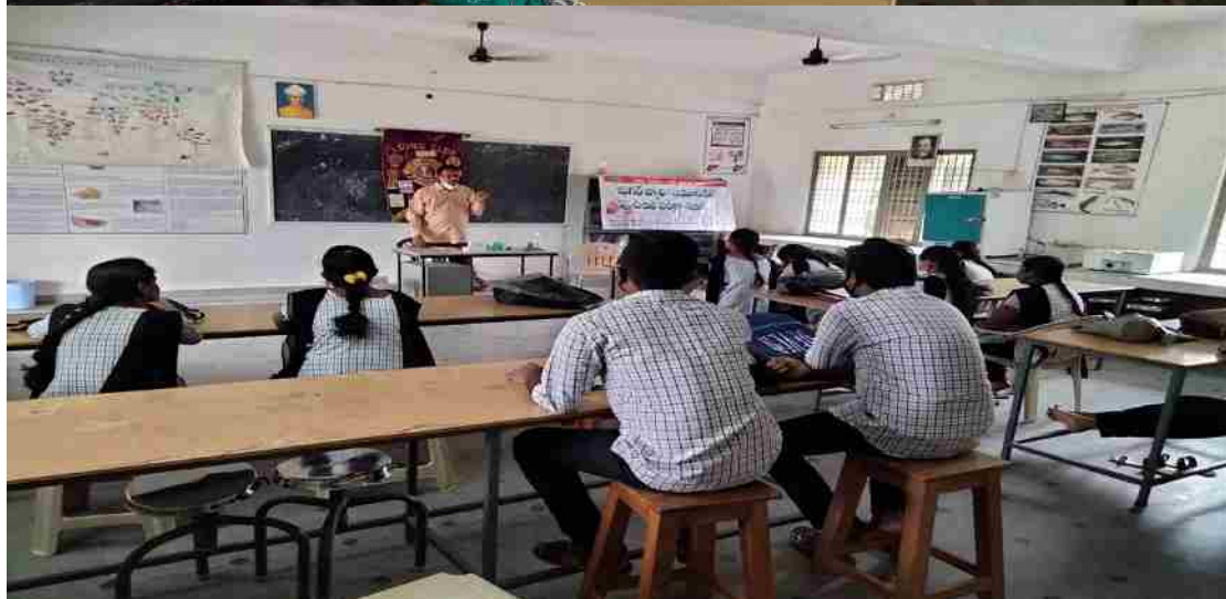
5. WORLD AIDS DAY ON 01-12-2021