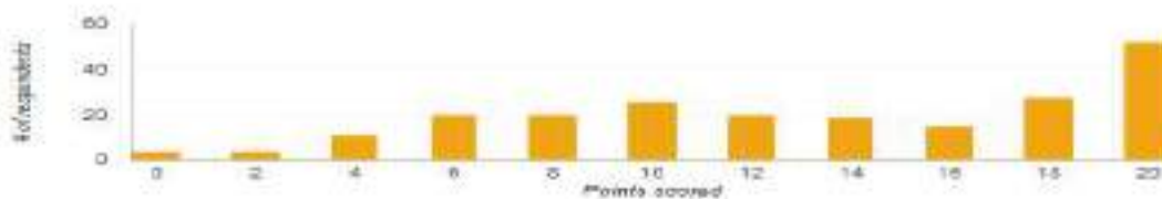
Total points distribution