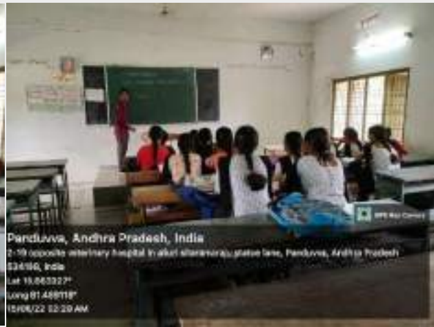
SEMINAR Presentation by IIB.SC(CS)Students on 15 th June 2022