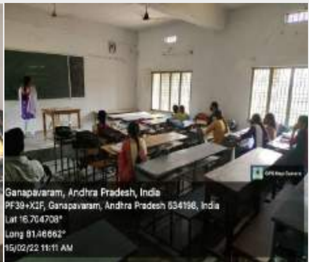
SEMINAR Presentation by IIB.SC(CS)Students on 15 th June 2022