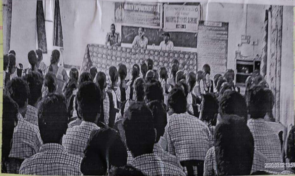
AWARENESS ON DISHA APP TO STUDENTS BY SUB-INSPECTOR OF POLICE, GANAPAVARAM