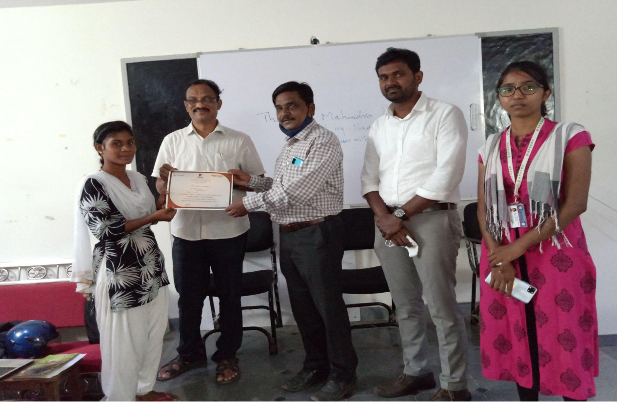
13.03.2021 Certificates distribution