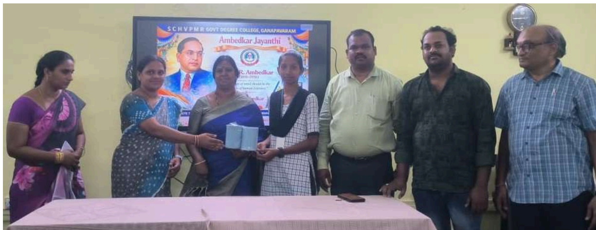
Prize distribution to students