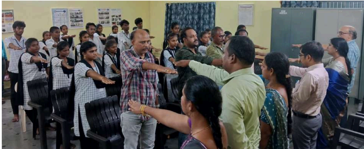
Pledge by Staff and Students